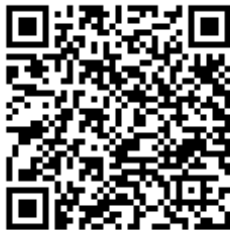
Código QR para validación en sede

Regulación CSV: Decreto 3628/2017 de 20-12-2017